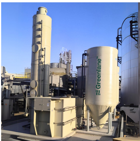
Cascade H 2 S installation

Low-cost and reliable regenerative bulk H 2 S removal for anaerobic digestion system biogas to meet pipeline specifications.