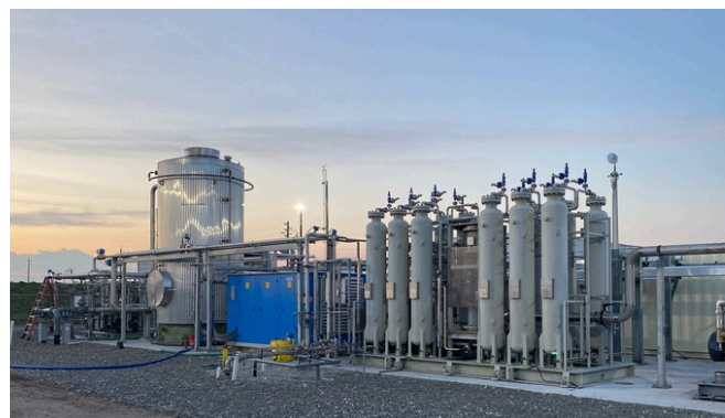
Cascade PSA AD installation